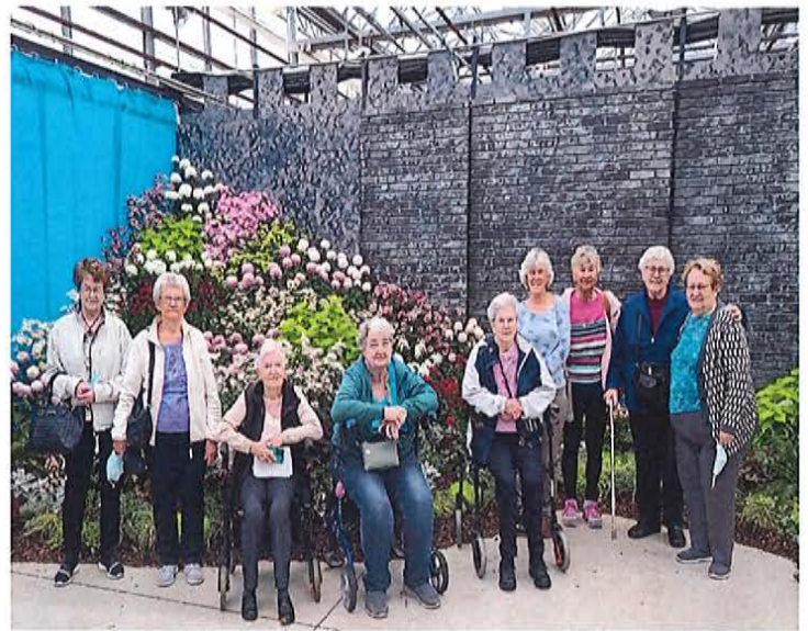
Hamilton Mum Show 2023 (Above and below)