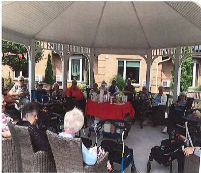
Canada Day Celebrations on the Patio (Below)