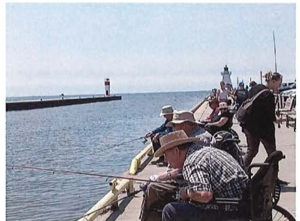
⇒ Fishing at Port Dover Pier (Nothing was caught except F.U.N.)