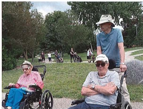
⇒ Simcoe Wellington Park Picnic and Stroll (Above)